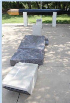
What was first thought to be vandalism the U.S. Submarine Veterans of World War II Memorial, at Wichita's Veterans Memorial Park over the weekend 07/26/09 turns out to have been an accident. A report was filed that two women were taking a photo when one leaned on the monument, knocking the 1000 lb. slab of granite from its base.

▪ Veterans park houses a variety of memorials